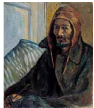
Ikuma ARISHIMA, "Portrait of Morikazu KUMAGAI" (1930)