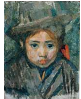
Tsune NAKAMURA, "Young Woman with Hat" (1912)