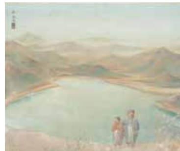
Hako IRIE "Apricot Blossom Time" (1926)