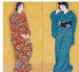
Banka NONAGASE, "Women," folding screen (c.1916)