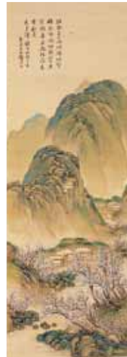
Kaiseki NORO, "Landscape with Plum Grove in Blue and Green" (1817)