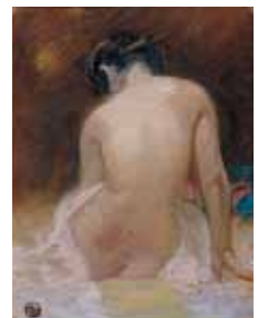
Takeji FUJISHIMA "Nude Woman" (1920)