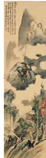
Gyokushu KUWAYAMA, "Autumn Landscape"