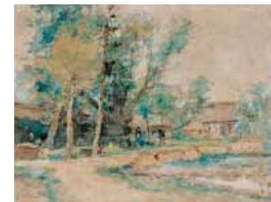
Chu ASAI, "Suwa Landscape" (1894)