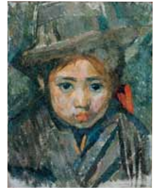
Tsune NAKAMURA, "Young Woman with Hat" (1912)