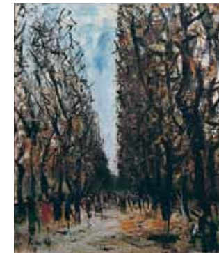
Yuzo SAEKI, "Jardin du Luxembourg" (1927)