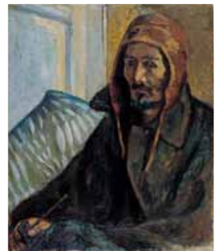
Ikuma ARISHIMA, "Portrait of Morikazu KUMAGAI" (1930)