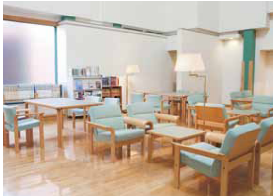
Salon and Library Corner