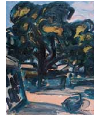
Katsushiro HARA, "Seto Landscape" (1935)